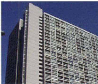
5. Ceramic wall coating for cooler interiors