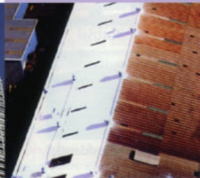
6. Restoration of old metal roof