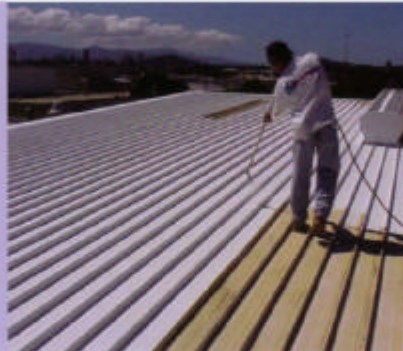
1. Applying ceramic material