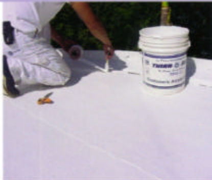
3. Waterproofing detail work