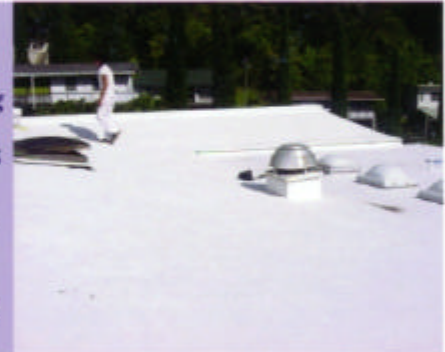
4. Completed roof with ceramic coating